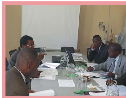
Delegates at the SEAPREN Meeting Windhoek

Directors and contact persons of the member institutes met in Windhoek on 15-16 August 2002, in order to finalise the funding application for Phase 1 of SEAPREN. The meeting deliberated on aspects relating to the co-ordination of the network, capacity building for institute management as well as collaborative research within the network.